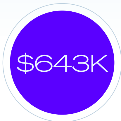
Median French ransom demand in the last year.