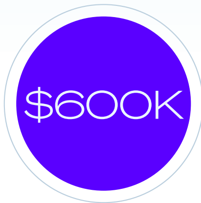
Median German ransom demand in the last year.