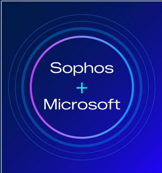
Sophos e Microsoft Stronger Together