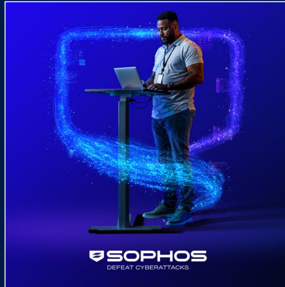
Prevention First Campaign