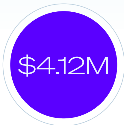
Median Italian ransom demand in the last year.