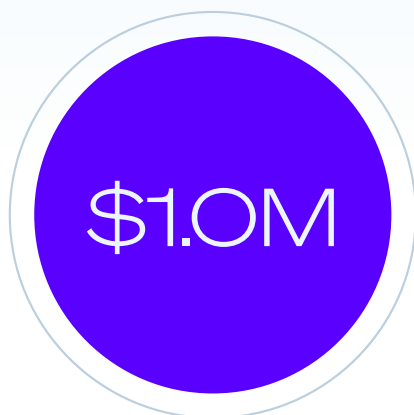
Median Chilean ransom demand in the last year.