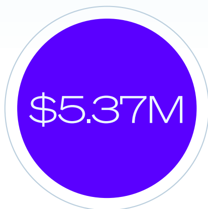
Median UK ransom demand in the last year.